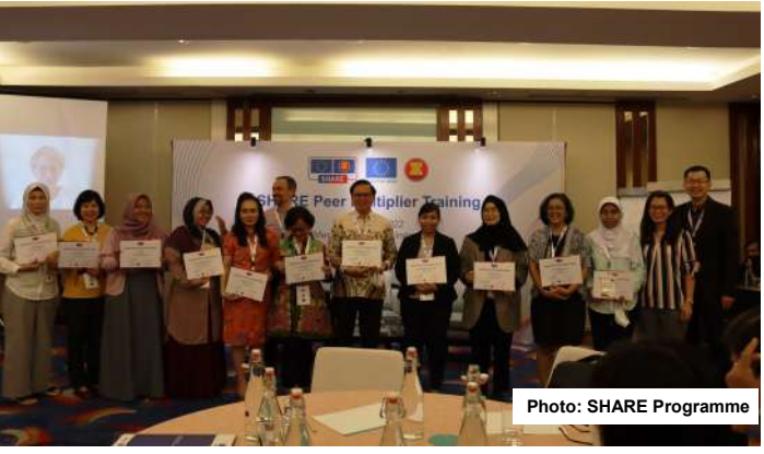
SHARE Peer Multiplier Training - Jakarta (Indonesia), 20-23 June 2022